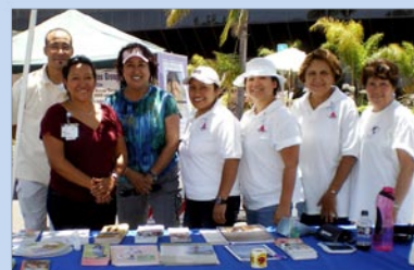
1st Annual Health & Community Summer Expo, Chula Vista