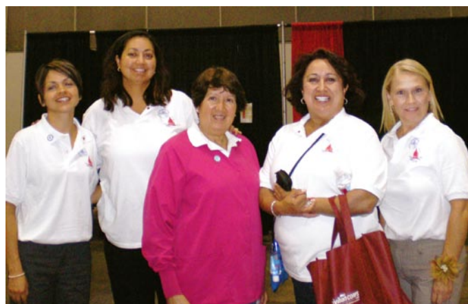
Dia de la Mujer, Los Angeles, August 2010

Would you like to attend the next NAHN National Conference in Las Vegas in July? SDNAHN is setting aside $1,000 yearly from the scholarship fundraiser for member professional development. Those with active SDNAHN memberships are eligible for funding of almost any activity to enhance your work-related knowledge, such as travel, review classes, and certification exam costs. The amount of funding available is dependent on the number of requests received. Please submit your application (available at www.sdnahn.org ) to any Board Member for consideration at a bi-monthly Board meeting. The due date for receipt of the application is one week before the Board meeting.