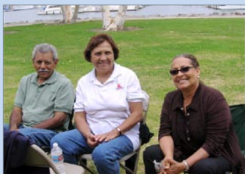
SDNAHN Annual Picnic, July 2010